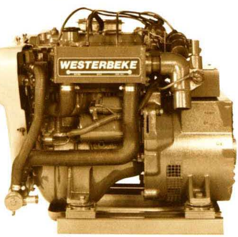
The 6.5 KW features very compact dimensions and simplicity of design.